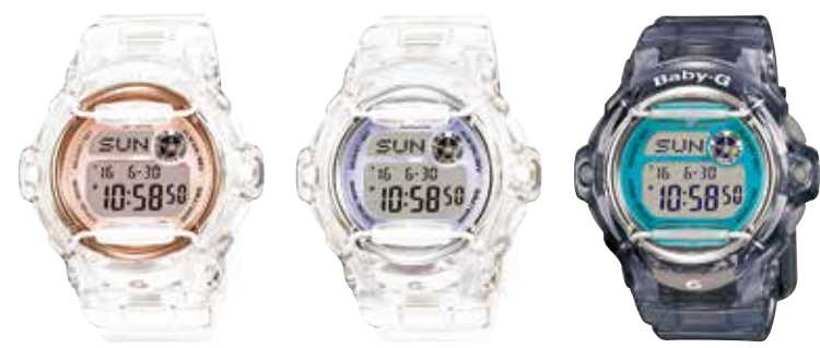
BG-169G-7B* BG-169R-7E* BG-169R-8B*

Handwritten signature and text: BABY-G!! BABY-G!!