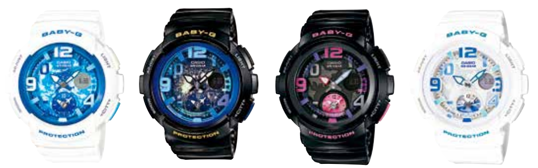
BGA-190GL-7B* BGA-190GL-1B* BGA-190-1B BGA-190-7B

The minute hand of the dial is shaped like an aircraft, which is keeping with the playful character of BABY-G.