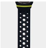
BGA-240 Series: Punching bands

BGA-240L / 240 | Shock resistant, 100m water resistance, Dual time, 1/100-second stopwatch (Memory capacity: Up to 60 records (used by lap/split time records and log title screen)), Countdown timer, 3 multi-function alarms, Auto LED light *New model